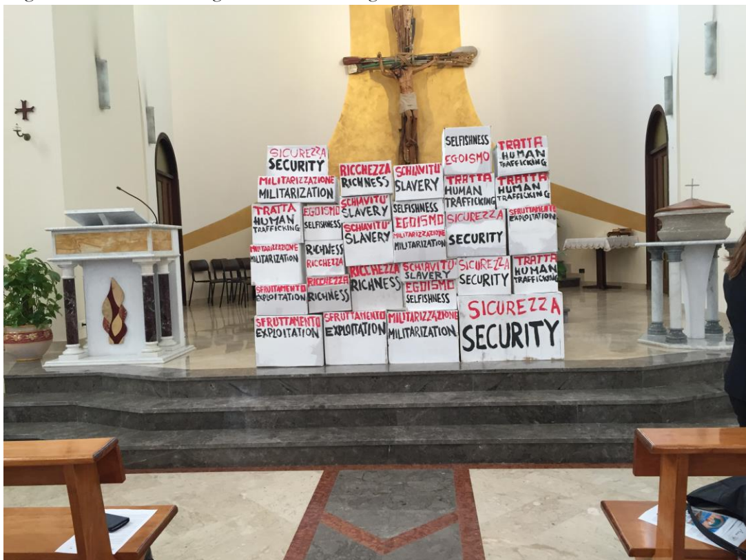
Ecumenical Commemoration Lampedusa, 3 October 2017