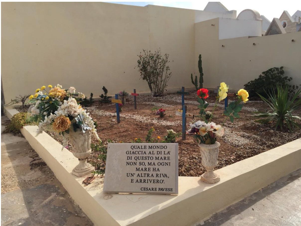
Graveyard Lampedusa, October 2017

Jesus says: »For I was hungry and you gave me something to eat, I was thirsty and you gave me something to drink, I was a stranger and you welcomed me in.« (Mt 25:35, NIV)