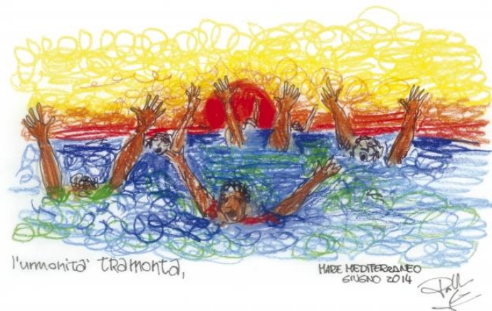
Paintings from the borders, Francesco Piobbichi, Mediterranean Hope

This is the time to stand for the defence of God's creation from violence and unjust acts, a struggle to advocating for adequate policy responding to the situation. Looking back at what happened through commemorations, and imagine the pains migrants went through and the unceasing sorrows to have observed their relatives or friends swallowed by the sea, shall awaken our conscience to stand for human rights and the dignity of every person. Commemoration is a way of raising awareness to the public of the tragedies that are taking place at our borders and to recognise that a lack of solidarity and providing a positive response may result in such losses of lives. Commemoration is to strive for justice and amity, to show love and humbleness as the word of God asks us to do and then bring about respect and dignity of the persons, and to prevent further losses.