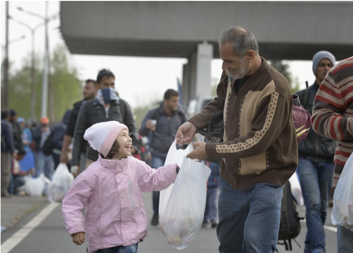
Serbia 2015

“The Church stands up for the weaker members of society and defends human dignity: every person is made in the image of God and life is always valuable and worth defending.” Jesus taught: “Do to others as you would have them do to you.” Helping people spiritually and materially is a big part of the work of congregations and the Church brings Christian values and perspectives to social dialogue and decision making. As an organisation, the Church is involved in cooperation for the benefit of those in need.