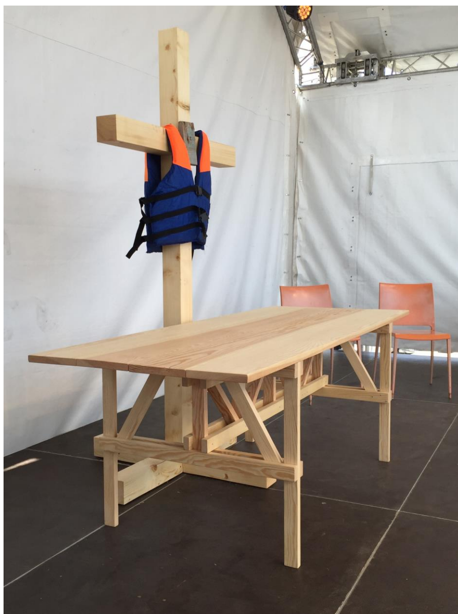
Fluchtgedenken, Berlin 26 May 2017

Churches' Commission for Migrants in Europe (CCME)